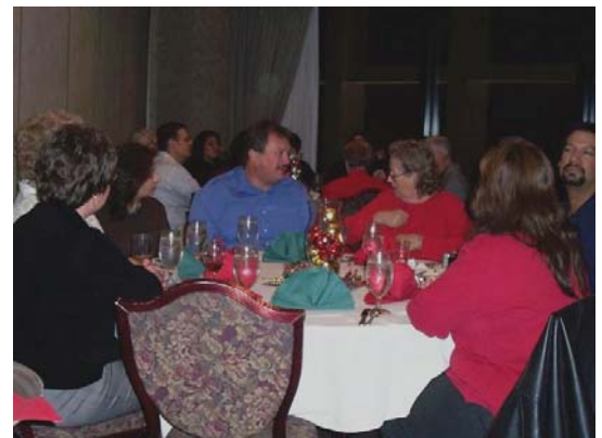
Members enjoying good food and good company